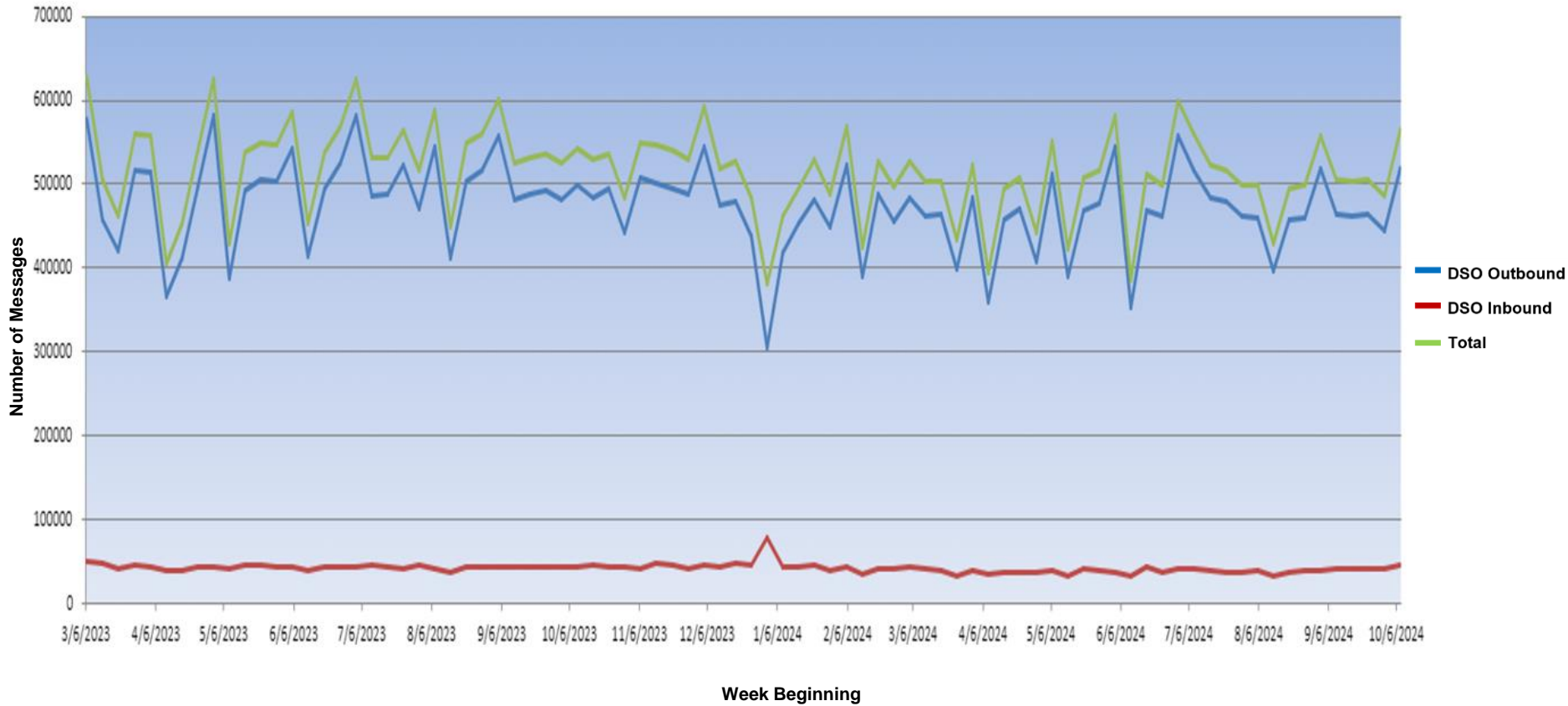
Market Message Volumes